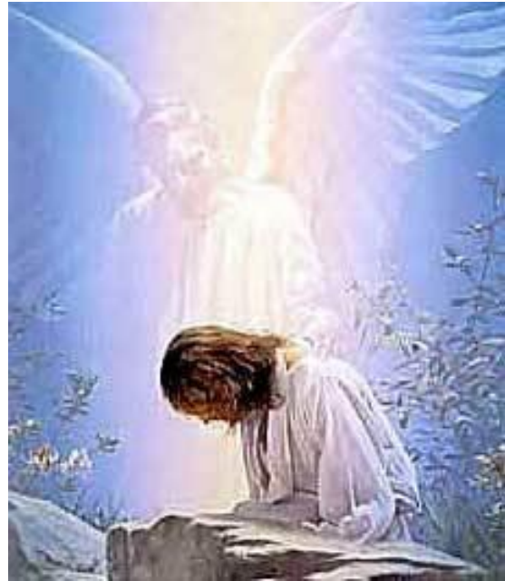
Agony in the Garden of Gethsemane

Just as angels came to strengthen Yeshua in the garden, they will come to minister strength to us in our own Garden of Gethsemane when making difficult but obedient choices.