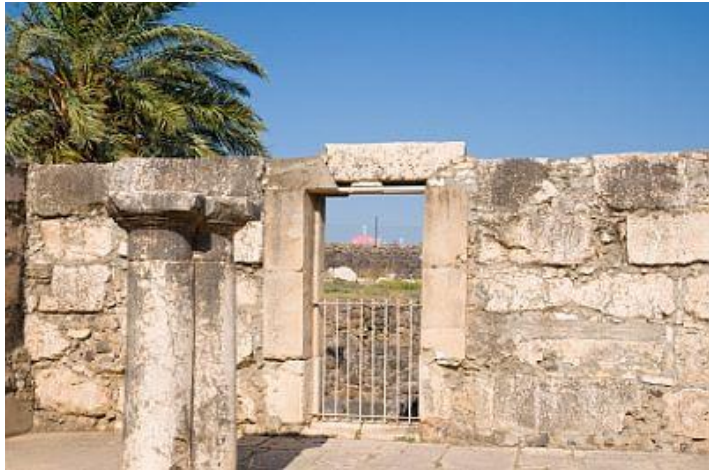
Gate at Kfar Nahum (Capernaum)

Why would God create the only way to life and blessing that is so narrow and difficult to find? Is God trying to make it hard for us to be saved? No, Yeshua is only telling us that the gate to salvation is a narrow one – it is only found through faith in the true Messiah – not through human effort or in any other way.