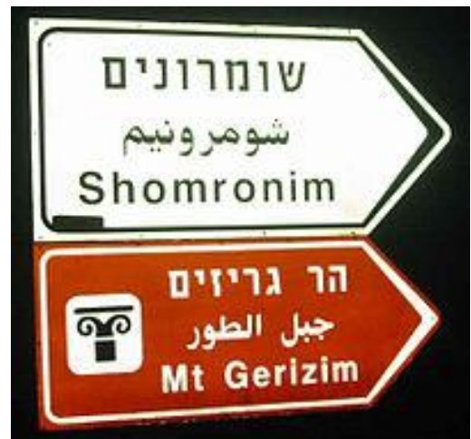
An Israeli road sign points to Har Gerizim

The entire future of the nation rests upon their decision. All Moses can do is clearly define the two paths, and point out where each one will eventually lead. The blessing was set on Mount Gerizim and the curse upon Mount Ebal. (Deuteronomy 11:29)