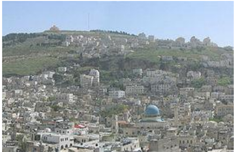
Old city of Nablus and Mount Gerizim in background

Most Samaritans today live in close proximity to Har Gerizim; and it is here that they perform their annual Passover sacrifice.