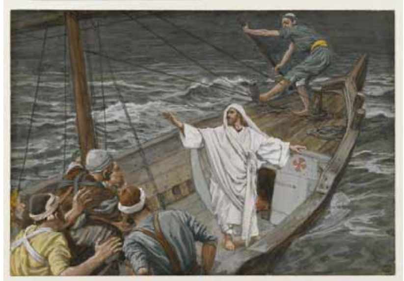
Jesus Stilling the Tempest. Painting by James Tissot (Brooklyn Museum)

No, Yeshua said in this world we will have trouble but that we can still be of good cheer, for He has overcome the world. 7 The peace that Yeshua gives us is not like the world gives. 8 It is a decision we make that no matter what others choose for themselves, we are going to hold onto our peace.