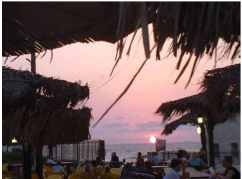
A sunset on the Mediterranean Sea – Kiryat Yam

We spend far too much time with our heads in our ‘busy work’ and totally miss out on the masterpieces of God’s glory all around us. Being surrounded by beauty is essential to our soul.