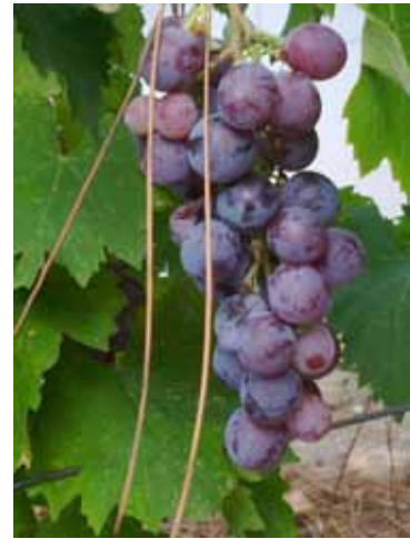
Grapes from our garden in the moshav

Through these trials and storms of life, we can choose to grow in the fruit of the Spirit: love, joy, peace, patience, goodness, gentleness, kindness, faithfulness and self control. 9 It may seem at times, that the trials bring out just the opposite, but in the end, they are doing a good work in each of us.