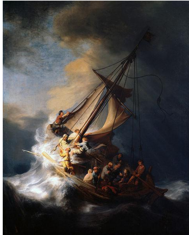
The Storm on the Sea of Galilee by Rembrandt, 1632.

In righteousness you will be established: Tyranny will be far from you; you will have nothing to fear. Terror will be far removed; it will not come near you. If anyone does attack you, it will not be my doing; whoever attacks you will surrender to you.” (Isaiah 54:11-15)