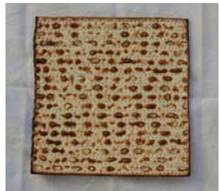
Matzah (Unleavened bread)

From the Middle Ages until recent times, this satanic lie was used to incite ignorant masses to outrage and even to massacre innocent Jewish people.